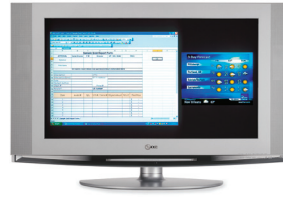
POP (Picture outside of Picture) can be used with TVs that have this feature